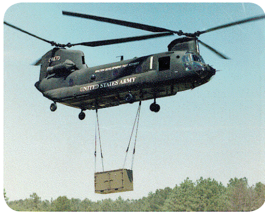
ISU® 60.5 transported by helicopter sling

*Above part numbers are for containers only; no accessories